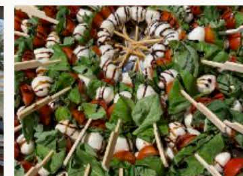
Tray Passed Appetizers starting at $6 per guest