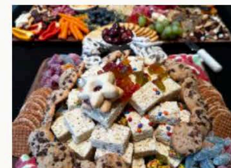
Kids snack corner

GATHER YOUR GUEST AROUND THE BOARD OR GRAZING TABLE AND ALLOW THEM THE PLEASURE OF DISCOVERING UNIQUE CULINARY COMBINATIONS TO PLEASE EVERY PALATE. FEATURING FRESH FRUIT, CRAFT CHEESES, DELECTABLE SNACKS, LOCAL HONEY AND JAMS, AND OUR CHEF CURATED SELECTION OF CURED MEATS. EVERY BOARD IS UNIQUE AND DESIGNED TO MATCH YOUR EVENTS VIBE.