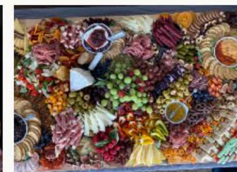
Ciao-cuterie boards something for everyone